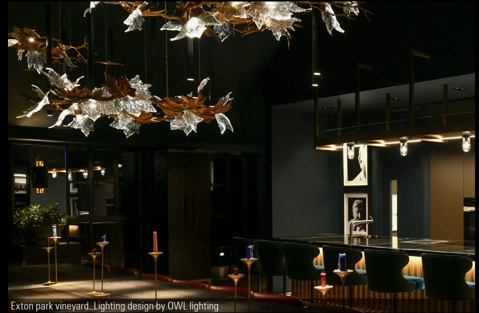
Exton park vineyard. Lighting design by OWL lighting